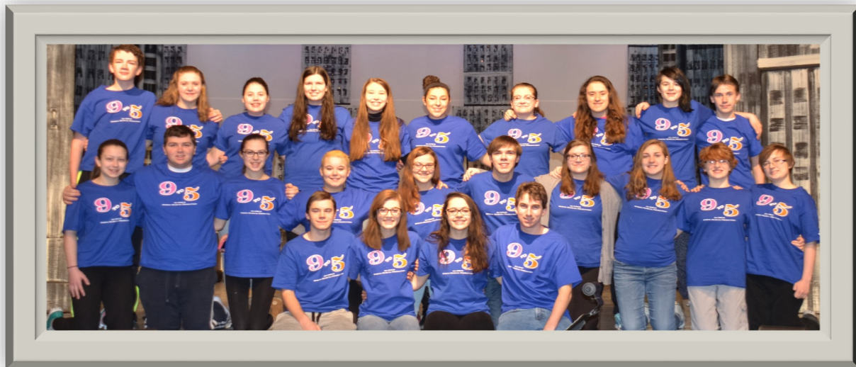
The cast of the 2016 MWCS production of “9 to 5, The Musical”